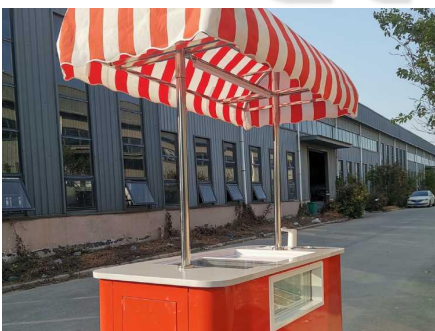
- Cart Frame -