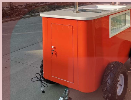
- Storage Cabinet -