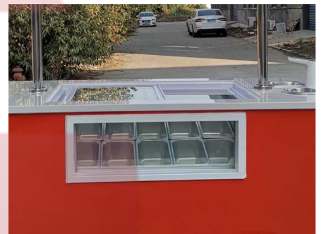
- Freezer -