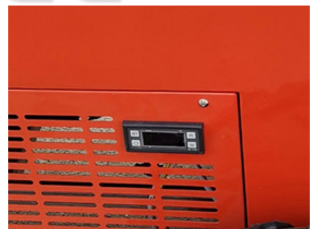
- Temperature Display -