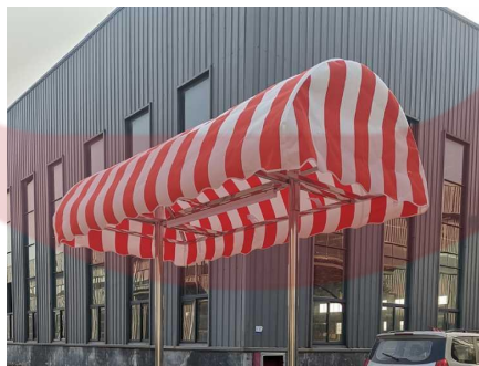
- Umbrella -