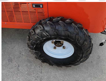
- Wheel -