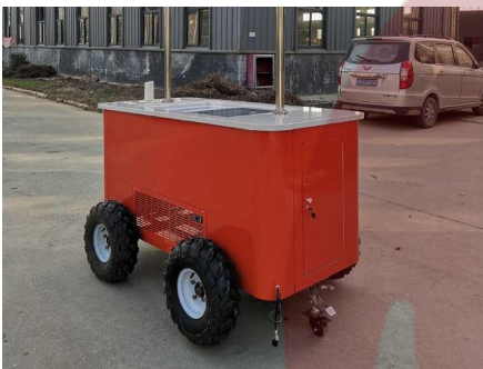
- Cart Body -