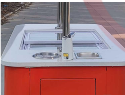
- Water Sink Kits -