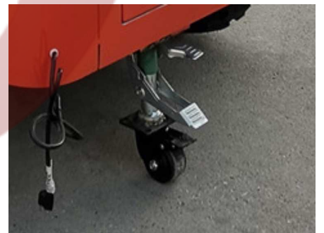
- Caster -